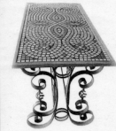
Shelby Downing is at Transient Crafters